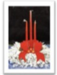
Flocked Centerpiece 1 or 3 Candles with decorations