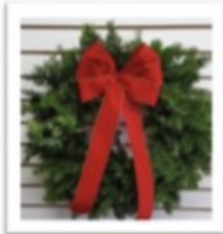
NATURAL WREATH with waterproof red velvet