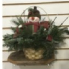
DECORATIVE BASKET with live evergreen (decoration may vary)