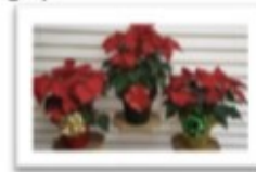
RED POINSETTIA 2 plants per pot, foiled with red bow