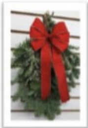
DOOR SWAGS red velvet bow

It's time to order your holiday decorations! Orders are due Monday, November 18 th and will be delivered to CHS on Tuesday, December 3 rd .